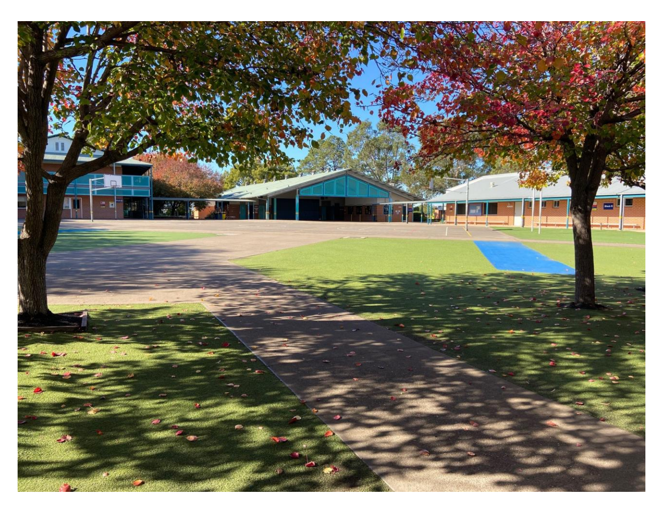
D.E.P.S Newsletter 16 June 2023