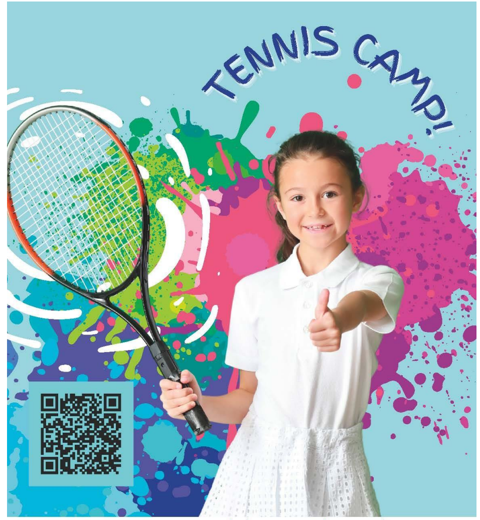
tennis world north ryde