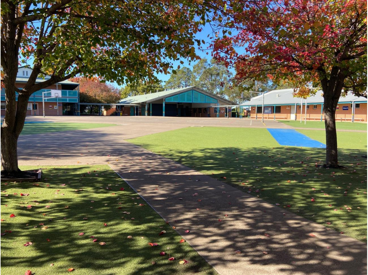
D.E.P.S Newsletter 28 July 2023